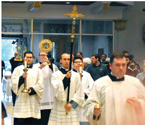
Procession of the relics of St. Padre Pio at St. Rita Church