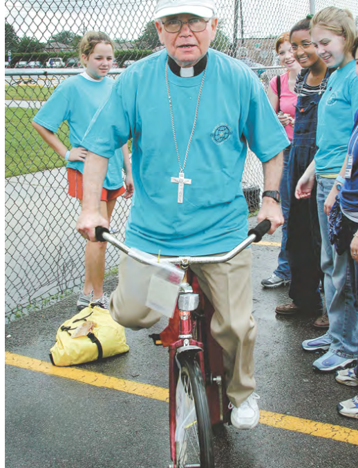
A kid at heart, Archbishop Hughes enjoys World Youth Day 2002 with teens from around the Archdiocese of New Orleans