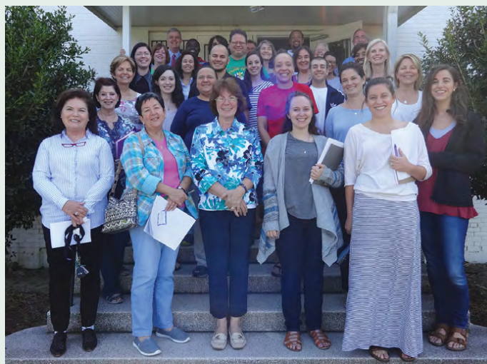
2017 ILEM Retreat

Thank you for your prayers for and support of our work, and thank you for allowing me to share with you the good things God is doing at Our Lady's Seminary!