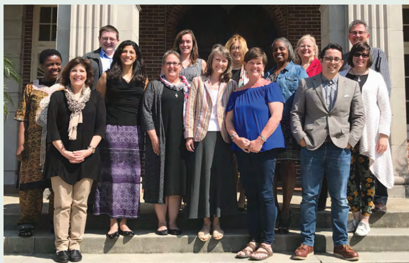
ILEM 2018 Cohort