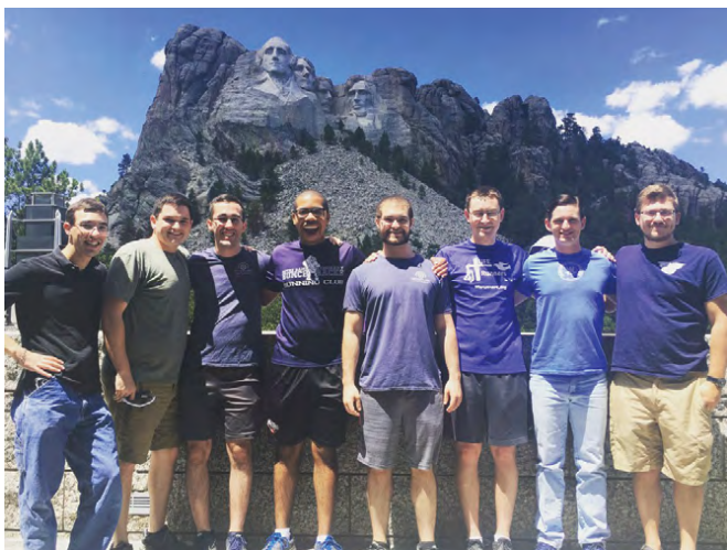
NDS Seminarians visit Mt. Rushmore in Keystone, South Dakota while attending The Institute for Priestly Formation this past summer.