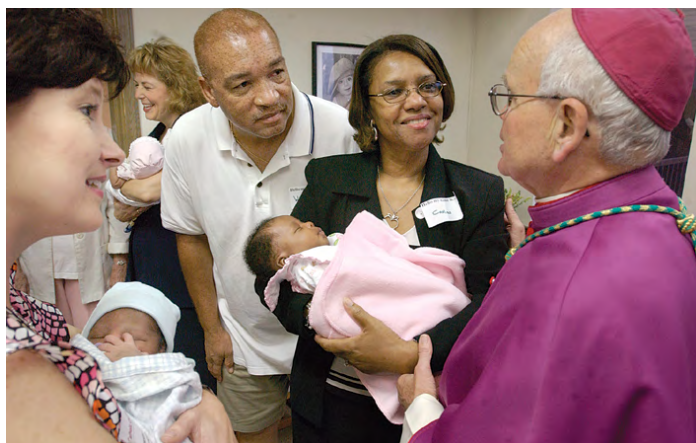
Archbishop Hughes meeting with men and women at the Pro Life Center