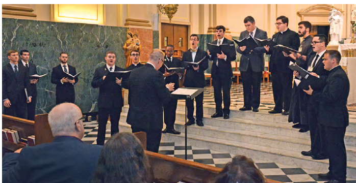
The Notre Dame Seminary Schola performs in the Chapel during the Gala