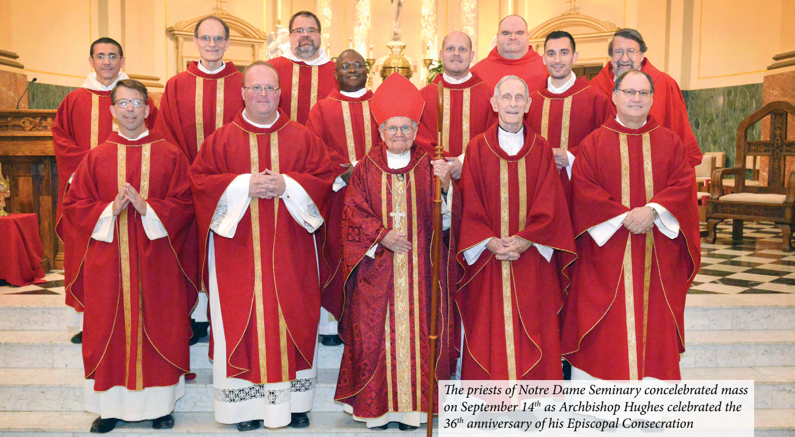
The priests of Notre Dame Seminary concelebrated mass on September 14 th as Archbishop Hughes celebrated the 36 th anniversary of his Episcopal Consecration