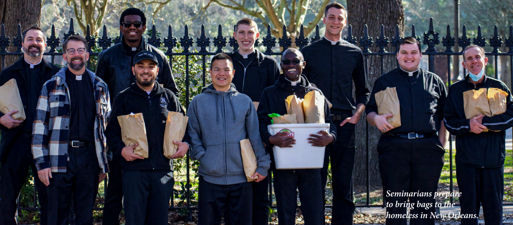
Seminarians prepare to bring bags to the homeless in New Orleans.