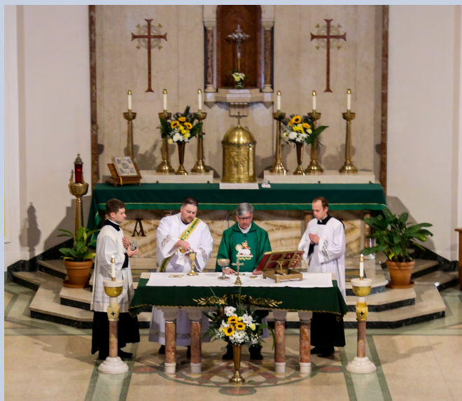
Seminarians and deacons serve at Mass at St. Rita's Catholic Church.