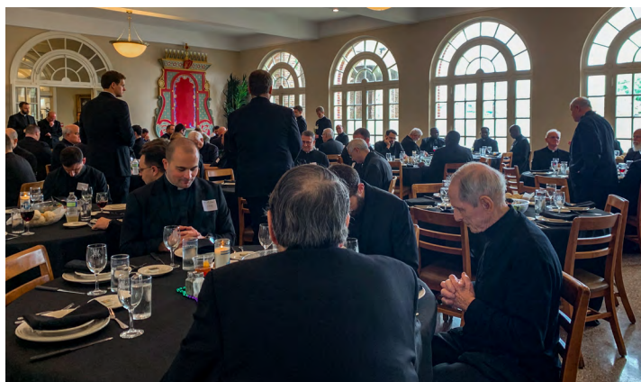
Over 100 priestly alumni join in prayer before the alumni lunch.