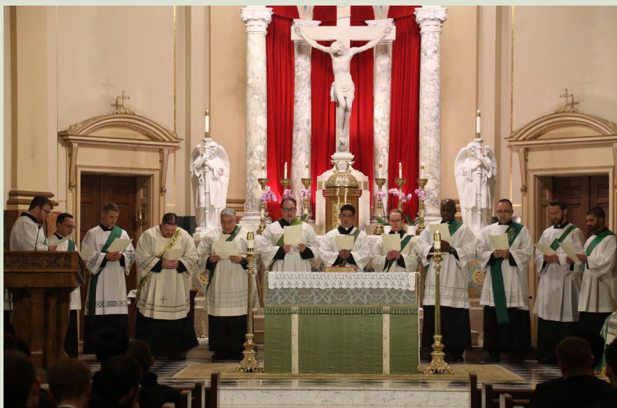
The Theology 4 class takes their Oath of Fidelity in front of the seminary community.